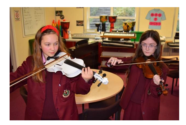
This is the Music Room.